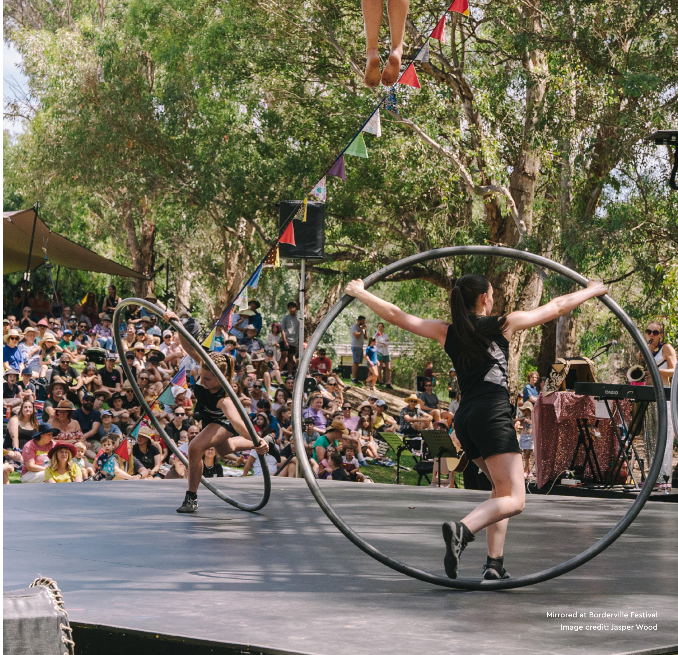
Mirrored at Borderville Festival

Environment is a standing agenda item for all meetings, ensuring impact is considered at every level.