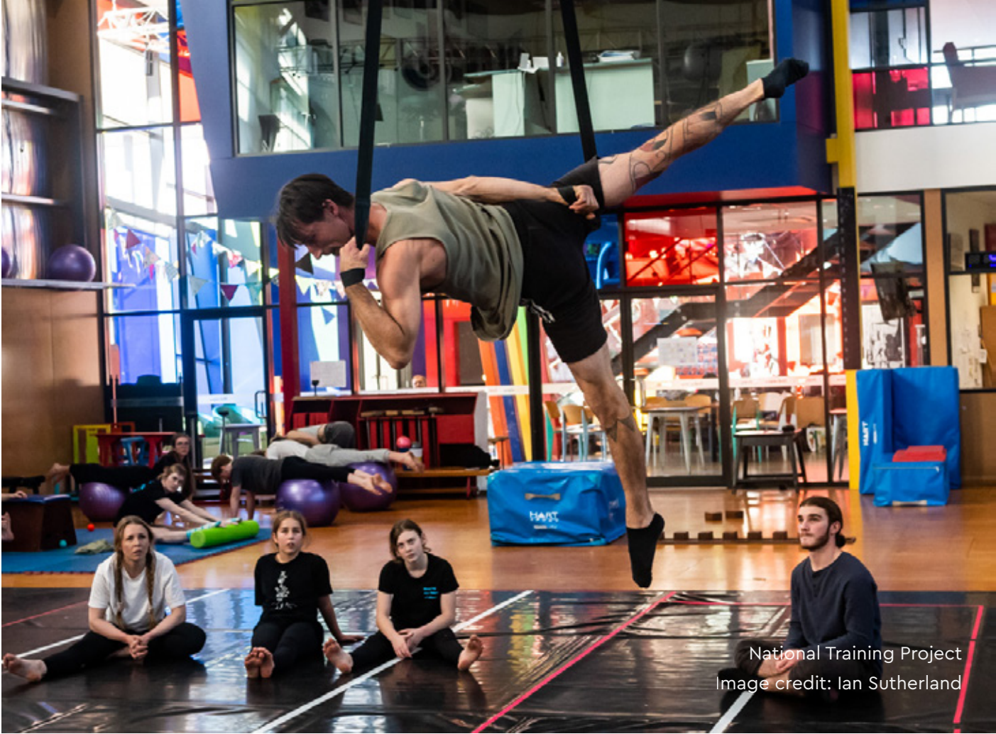
National Training Project