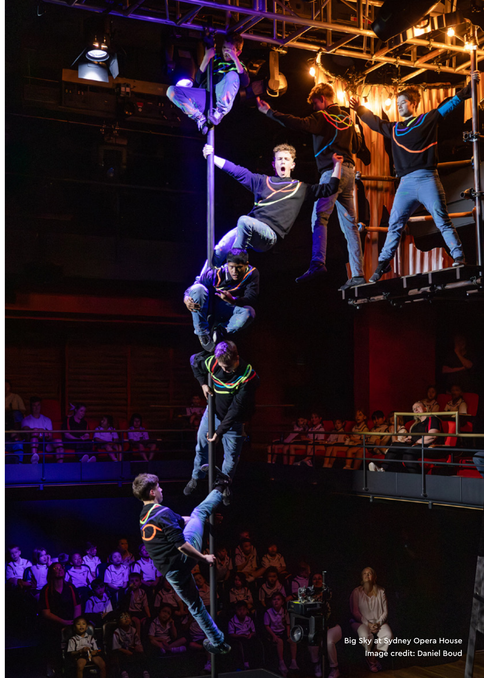
Big Sky at Sydney Opera House