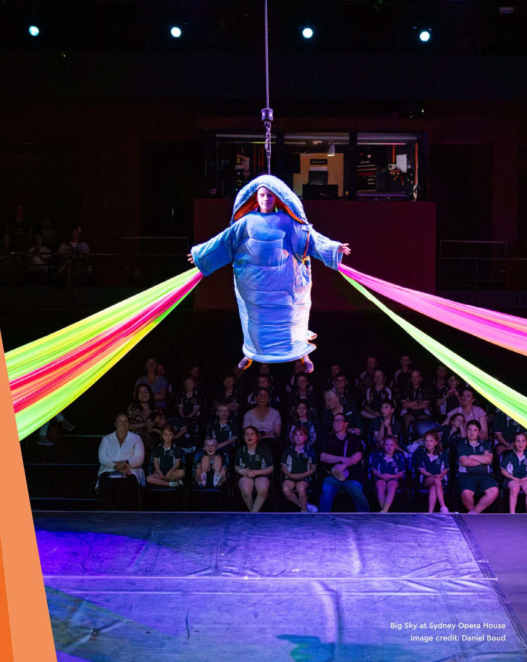
Big Sky at Sydney Opera House