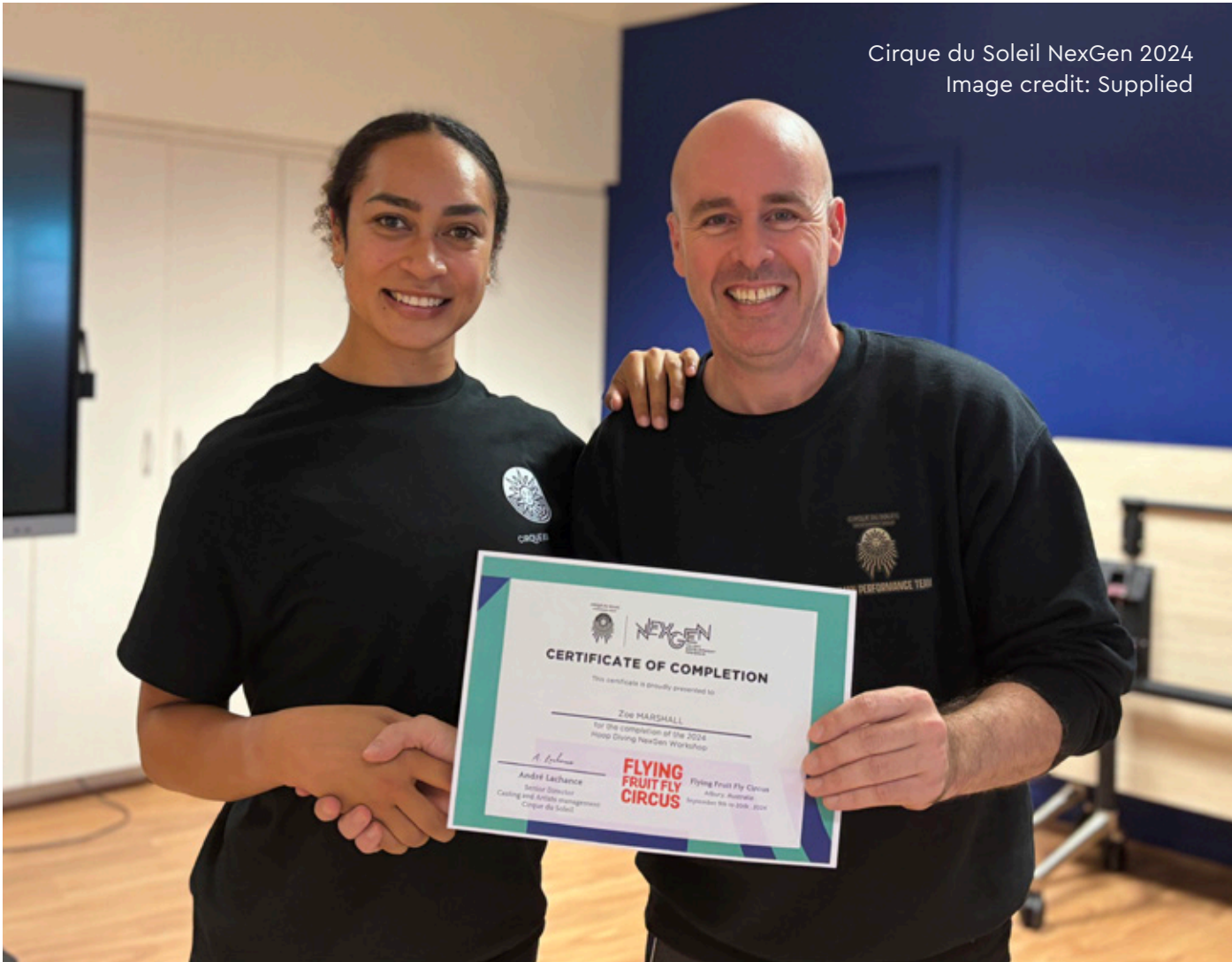
Cirque du Soleil NexGen 2024

The National Training project is an annual training intensive for students from around the country to train at the Flying Fruit Fly Circus with our core training staff and guest artists. 2024 was the third year of our partnership presenting NTP with Circa Contemporary Circus. In 2024 the National Training Project was attended by 91 participants, from all Australian states and territories.