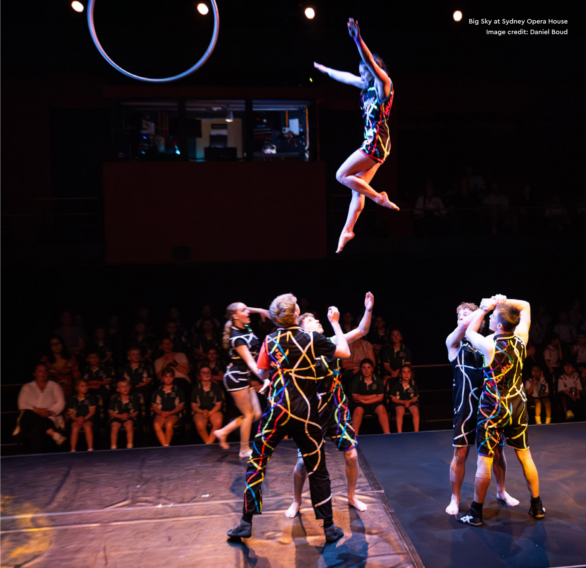
Big Sky at Sydney Opera House