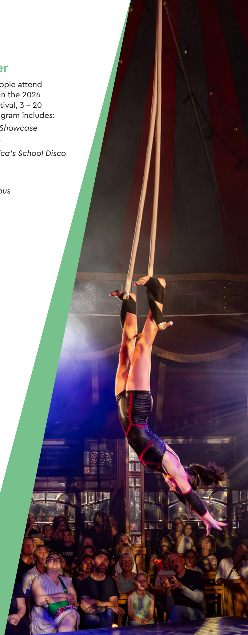
Live and Famous at Carriageworks